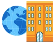
Installed Near You