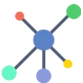
Input File Formats