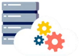
Modern Cloud Architecture