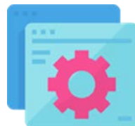
Setup and Configuration